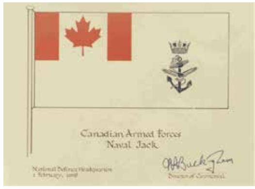
at various stages during the Canadian Armed Forces Naval Jack as approved, deliberations on the subject in 1 February 1968.

This is very close to the language used in the notice in the Canada Gazette announcing the approval of the Canadian Armed Forces Naval Jack on 1 February 1968.<sup>68</sup> The version depicted there - still in use today, of course, as the Canadian Naval Ensign – was the "lone survivor," if you will, of five possible contenders discussed 1967