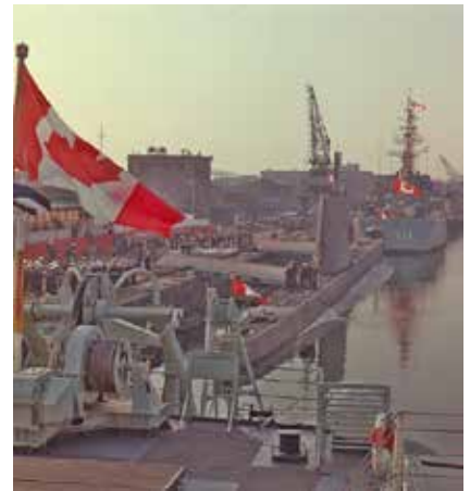
Not a naval flag in sight: the maple leaf flag flying as both ensign and jack at the commissioning of HMCS Ojibwa , 23 September 1965.

but also of course the Blue, and – perhaps the one most in need of a change given its complete lack of any specifically Canadian symbolism – the navy's White Ensign.<sup>5</sup> Writing of that period, some naval historians have evoked the moment on 15 February 1965 when the White Ensign was lowered for the final time in Her Majesty's Canadian Ships,6 but I have yet to encounter either text or photos capturing the simultaneous demise of the Canadian Blue Ensign.<sup>7</sup> Perhaps the substitution of one Canadian symbol for another was not deemed to have the same impact, visual or otherwise, as the displacement of one that was entirely British.