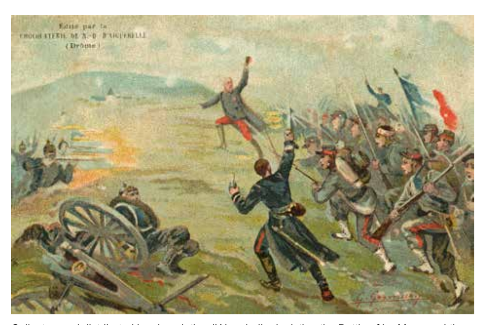
Collector card distributed by chocolatier d'Aiguebelle depicting the Battle of Le Mans and the French attack at Auvours on 11 January 1871 with General Gougeard leading the charge.

The engagement at Auvours, in which Gougeard participated, was part of the larger Battle of Le Mans and arguably not the most significant. In fact, Jauréguiberry and his 16<sup>th</sup> Corps protected the main approaches to the city and offered the strongest resistance.<sup>20</sup> The drive by the Prussians at Auvours attempted to exploit a weaker spot and bypass the bulk of French forces for a flanking attack from behind. When Gougeard arrived on the scene with his auxiliary division, French soldiers were retreating and running away with no semblance of order.<sup>21</sup> The volunteers did not dare break ranks being more scared of Gougeard than the Prussians, told they would be shot on the spot if