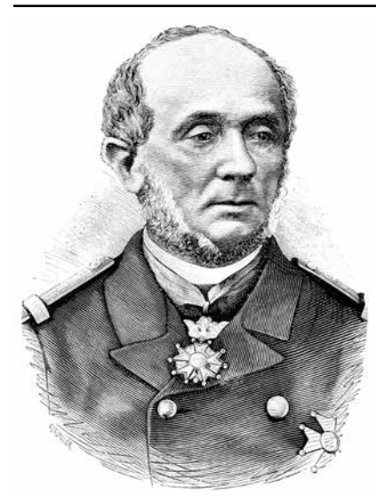
Vice Admiral Jean Bernard Jauréguiberry

retirement. This did not necessarily mean that they were political in a conventional sense. The majority were typically drawn to conservative or royalist parties, which drew votes away from republicans, radicals, and socialists in the mid-1870s sufficient to form governments. Many of those governments were tumultuous and lasted only a few months at a time. In 1877 alone, four admirals served as ministers of marine and one general on an interim basis for five days during a constitutional crisis staged by the conservatives and General Patrice de MacMahon. When moderate politician Jules republican Dufaure restored some stability for a time, Admiral Pothuau returned as minister of marine on 13 December 1877. Though democratic ideals of liberty and equality underpinned