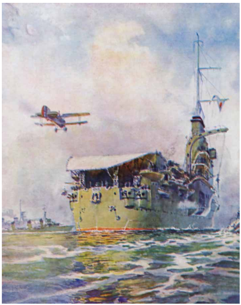
The French aircraft carrier Béarn , a conversion from a surplus Normandie-class battleship hull, commissioned in December 1927. ( L'Illustration no. 4454, 14 July 1928)