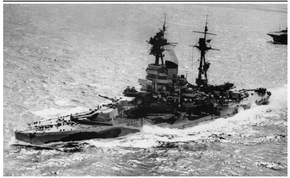
HMS Resolution sailing in the Indian Ocean.

The Captain told me that he had written a letter to headquarters, recommending me for a Watch Keeping Certificate – which will give me a WK before my name in the Navy List. Already have a G in brackets there. There will not be many lieutenants junior to me who have one. It was something I wanted to get before I left this ship, and so I was quite pleased when he told me that.<sup>57</sup>