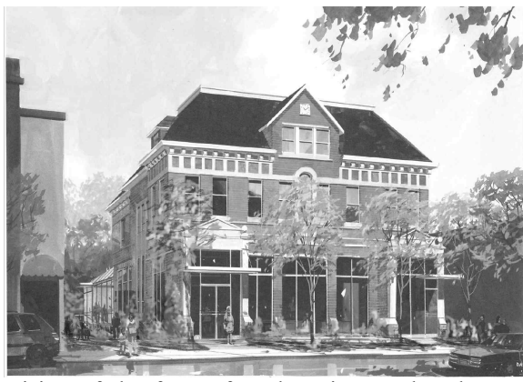
Vision of the future for The Victory, the plans of architect Allan Rae, that adds a further dimension to the reality of the dream. The rebuilt façade is based upon late 19<sup>th</sup> and early 20<sup>th</sup> century plans and photographs except that it brings access down to street level. Rendering by David Dawson.

With the belief that everyone will find pride and satisfaction in the Societies' goals towards the enhancement and well being, now