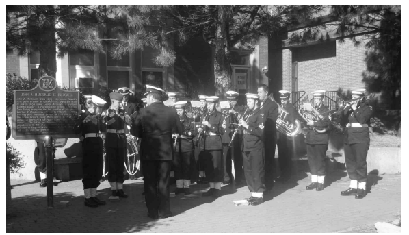
A celebratory tune on Trafalgar Day from the Ship's Band of Sea Cadets from HMCS Quinte , where youth and history interact. The band continued to delight the public inside for another hour or so.

party with HMCS Quinte 's Sea Cadets Ship's Band impressing all, and a Book Fair with Canadian publishers Vanwell and John Lord Books participating. Members and the public alike congregated to celebrate benchmarks of achievement and significant events in the Society's history.