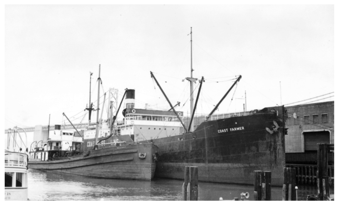
Illustration 1: SS Coast Farmer. One of only three ships which succeeded in running the Japanese blockade from Australia to the Philippines during early 1942. Her Philippine destination was Mindanao.

Brisbane on 18 February. Routed eastward into the open Pacific, she would pass east of the New Hebrides and the Solomons before entering the Philippine inland sea via the Surigao Straits, her destination the port of Cebu City on the island of Cebu where she made safe arrival. The third ship to leave was the Hong Kong-registered Anhui which, in addition to rations and ammunitions, carried three boxed P-40 fighter aircraft as deck cargo. Anhui left Australia on 22 February, being routed to approximately follow the same path which had been taken by Coast Farmer . Her destination was also Cebu City, where she arrived on 10 March