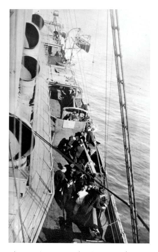
Figure 3 - Rainbow's port battery (looking aft). One 12-pounder and three 4.7-inch can be seen. Royal BC Museum Archives Photo #A-05935 photographer unknown, date listed 1910 although likely later than this

recommissioned for Canadian service, Rainbow had been re-equipped with the 6-inch/40 Mark II QF gun.