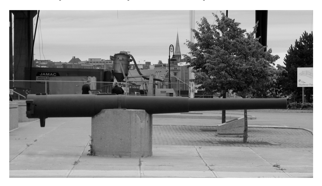
Figure 4 - A 6-inch/40 Mark II from HMCS Niobe in front of HMCS Brunswicker . Another of Niobe's guns is in front of the New Brunswick Museum in Fredericton. Niobe's guns were used in the Partridge Island battery during the Second World War as part of the harbour defence system for the port of Saint John.

place of the former 6-pounder broadside mount locations, was a 12-pounder 12 cwt (probably Mark I) weapon firing separate ammunition at about 15 rounds per minute. The 12-pounder had been designed in 1893 for destroyers but also had been installed in larger cruisers as a replacement for the 6-pounder in the anti-torpedo boat role. 53