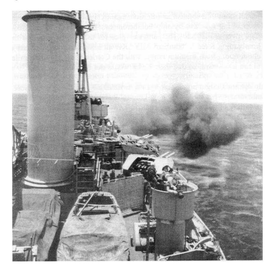
Figure 4: Bombardment by HMCS Uganda of Sukuma Airfield on Miyako Jima, Sakishima Islands (vicinity), 4 May 1945.

hoses would burst. On such occasions fuelling took up to six hours longer than it should have done; and only by steaming at full speed through the night could the flying-off position be reached in time for our first day's operation.56