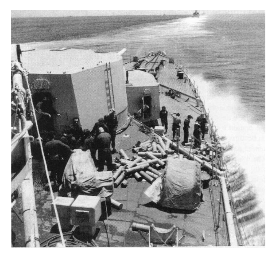
Figure 3: Decks of HMCS Uganda after her bombardment of the Sakishima Island airstrip of Sukama, south of Okinawa, [Japan], 12 May 1945.

"to give Okinawa and the vicinity a complete working-over." The invasion force was composed of the Tenth Army's three marine and four army divisions, the landings to take place on a four-division front over five miles of beach. <sup>50</sup> The BPF's role, if any, was only determined when the assault was barely weeks away. "Not until mid-March, and after a good deal of pressure from London, did they decide that Fraser's ships should take part in operation `Iceberg;' and even then they inserted a proviso that they could be transferred elsewhere at seven-days notice."51