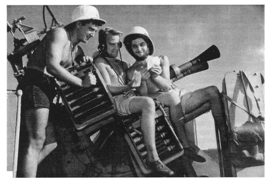
Figure 2: Sailors of HMCS Uganda examining Kodak pictures.

Canada's Naval Board followed the New Zealand example, and accepted the Admiralty's request to retain the name, at least for the time being.'