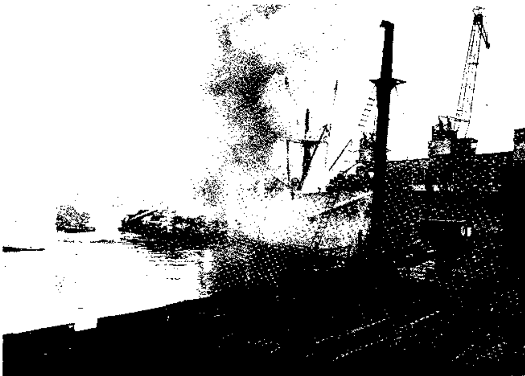
Figure 3: Tugs Tow Away Blazing Lumber Barge (CPR Dock behind Crane).