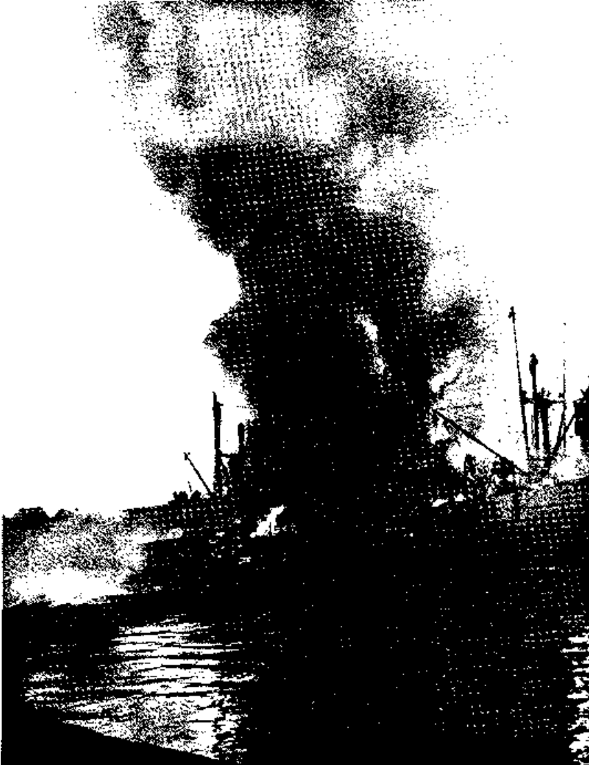
Figure 2: Ship Engulfed by Thick Smoke Soon after Explosions.